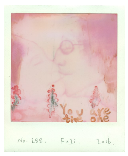
"No. 288", Fuzi, 2016