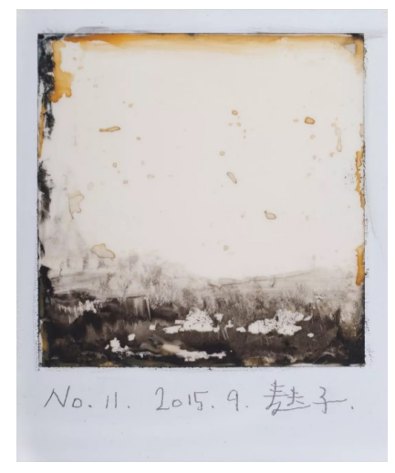
"No. 11", Fuzi, 2015