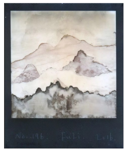
"No. 196", Fuzi, 2016