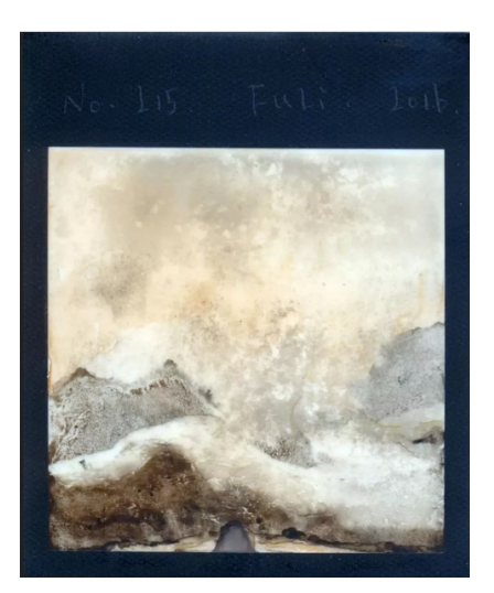
"No. 215", Fuzi, 2016