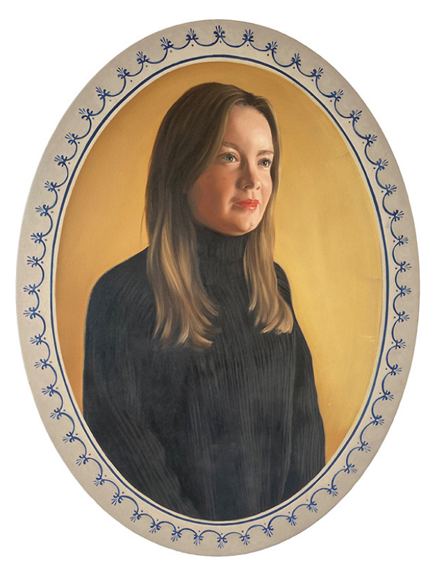
D.H. 2022 | oil on canvas | 80x60cm