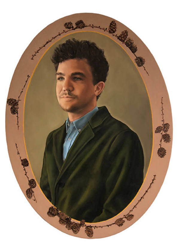
Triple Portrait 2021 | oil on canvas | each 80 x 60