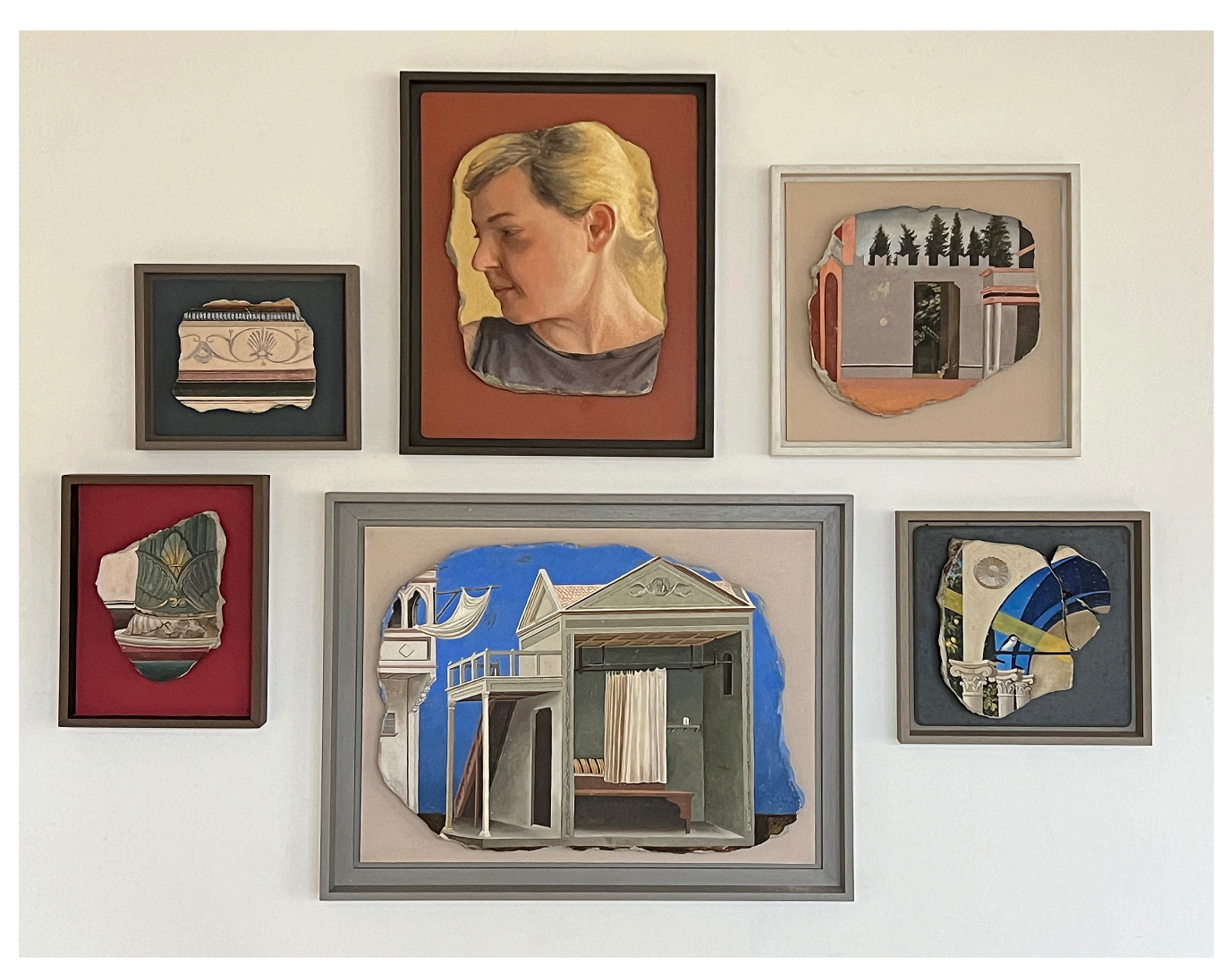
Fresko-Fragments 2022-23 | oil on styrofoam and plaster | biggest 47×57cm | framed