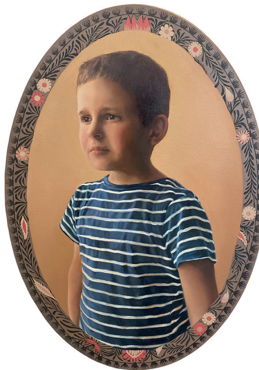
F.T. 2020 | oil on canvas | 80×60 cm